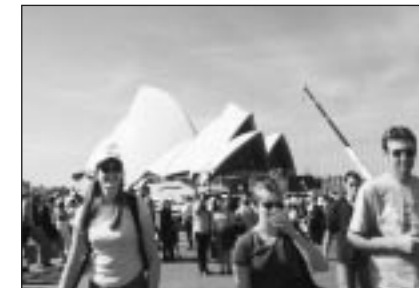
Sydney's world famous Opera House—one of the city's most distinguishing features—was surrounded by crowds who received Gospels of John from League volunteers.

What do a real estate broker, a home-maker, a carpenter, an agronomist, an administrative assistant, a software engineer, and twelve others of differing occupations have in common? Together they traveled over 20,000 miles in 14 days to and from one of the most beautiful, modern, and popular cities in the world—Sydney, Australia—for the 2000 Summer Olympic Games.