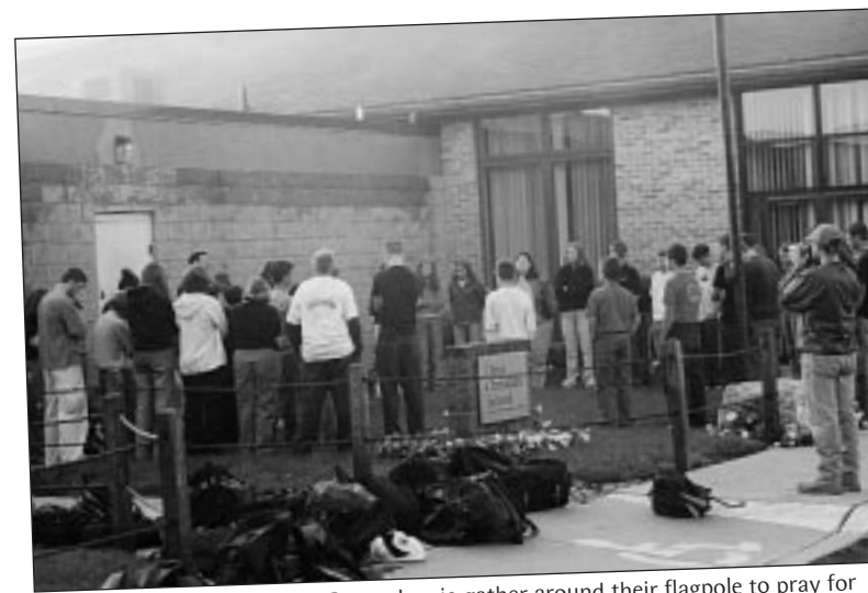
Students at a school in Lititz, Pennsylvania gather around their flagpole to pray for their school, fellow students, and our nation.