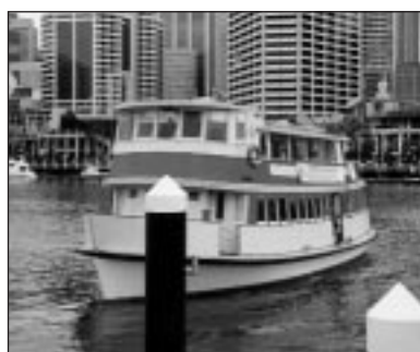
Cruising on this ferry boat and handing out Gospels at the end of the cruise was a "tough" job, but someone had to do it!

God also provided a great opportunity for our team through an Australian ferry boat captain who used his boat for God during the Olympic Games. Four times each day he would take people for cruises of the famous Sydney Harbor. While on the cruise people would see the sites, be entertained by musical artists, AND hear the Gospel message before returning to shore. It was a "captive" audience. But all enjoyed it and only complimentary comments were heard as all departed—AND as they departed, they received a League Gospel of John from a team member.