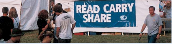
The Purple Door Music Festival, held last summer