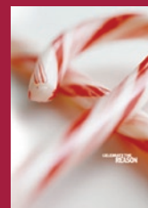
"Celebrate the Reason" was designed for the Christmas season.

Even as 2004 began coming to a close, we continued to introduce new covers to meet the needs of our precious members. Knowing that people respond best when given something relating to their interests, we offered a limited-edition Christmas cover that saw such high demand we ran out in just three weeks. Our Extreme Freedom cover for active people and our new business cover, produced in partnership with BBL Forum, were released at the end of the year.