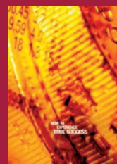
"How to Experience True Success" was designed to reach out to executives and the business community.