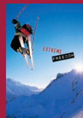
"Extreme Freedom" is perfect for active people.